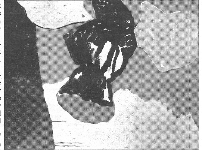
"Flying Pawn" by Chris Randolph

"Plastic Fantastic" comprises innovative current sculptures and bas-reliefs focusing on the use of tangible synthetic new media such as plastics,